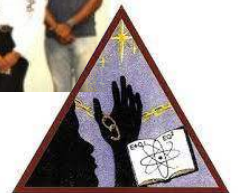
NATIONAL ACHIEVERS SOCIETY